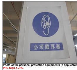
Photo of the personal protection equipments (if applicable) PPE-Sign-1.JPG