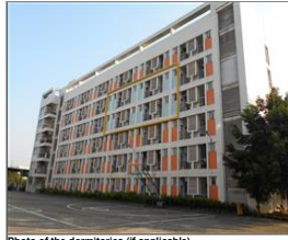
Photo of the dormitories (if applicable) Dormitory Building-1.JPG