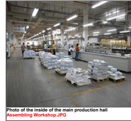
Photo of the inside of the main production hall Assembling Workshop.JPG