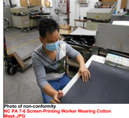
Photo of non-conformity NC PA 7-6 Screen-Printing Worker Wearing Cotton Mask.JPG