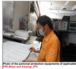
Photo of the personal protection equipments (if applicable) PPE-Mask and Earplug.JPG