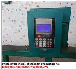
Photo of the inside of the main production hall Electronic Attendance Recorder.JPG