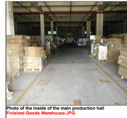
Photo of the inside of the main production hall Finished Goods Warehouse.JPG