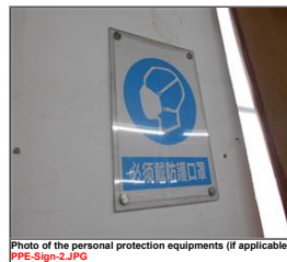
Photo of the personal protection equipments (if applicable) PPE-Sign-2.JPG