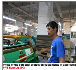
Photo of the personal protection equipments (if applicable) PPE-Earplug.JPG