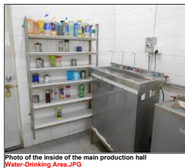
Photo of the inside of the main production hall Water-Drinking Area.JPG