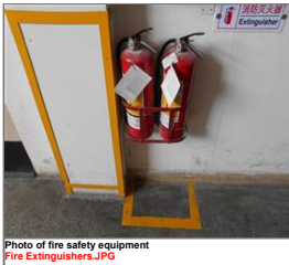
Photo of fire safety equipment Fire Extinguishers.JPG