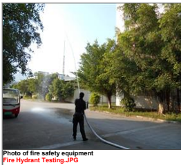
Photo of fire safety equipment Fire Hydrant Testing.JPG