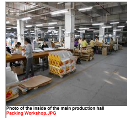
Photo of the inside of the main production hall Packing Workshop.JPG