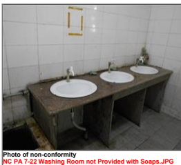
Photo of non-conformity NC PA 7.22 Washing Room not Provided with Soaps.JPG