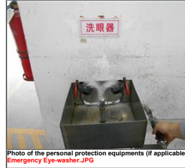
Photo of the personal protection equipments (if applicable) Emergency Eye-washer.JPG