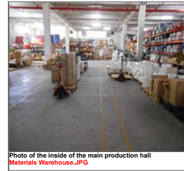
Photo of the inside of the main production hall Materials Warehouse.JPG