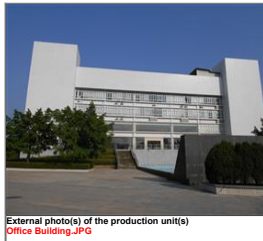
External photo(s) of the production unit(s) Office Building.JPG