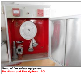
Photo of fire safety equipment Fire Alarm and Fire Hydrant.JPG