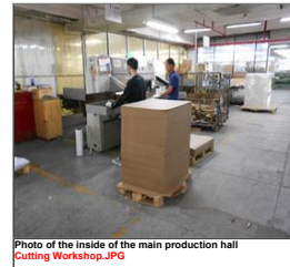
Photo of the inside of the main production hall Cutting Workshop.JPG