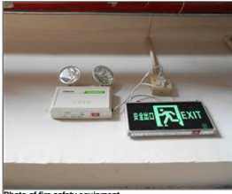
Photo of fire safety equipment Emergency Lights and Exit Sign.JPG