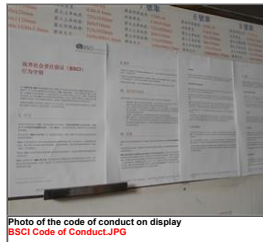
Photo of the code of conduct on display BSCI Code of Conduct.JPG