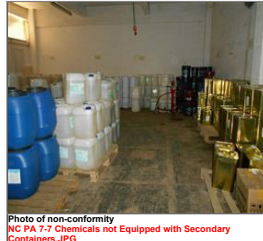
Photo of non-conformity NC PA 7-7 Chemicals not Equipped with Secondary Containers.JPG