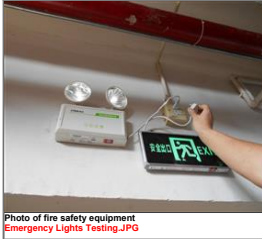
Photo of fire safety equipment Emergency Lights Testing.JPG