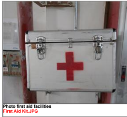
Photo first aid facilities First Aid Kit.JPG