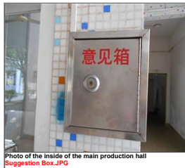
Photo of the inside of the main production hall Suggestion Box.JPG