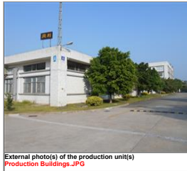
External photo(s) of the production unit(s) Production Buildings.JPG