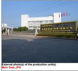
External photo(s) of the production unit(s) Main Gate.JPG