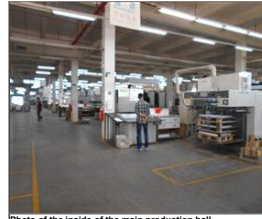
Photo of the inside of the main production hall Printing Workshop.JPG