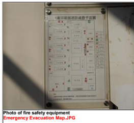
Photo of fire safety equipment Emergency Evacuation Map.JPG